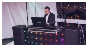
DJ playing the music