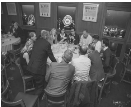
Guests interacting in the workshop