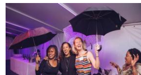
Girls just wana have fun!!