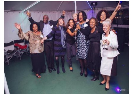
Singing & Dancing