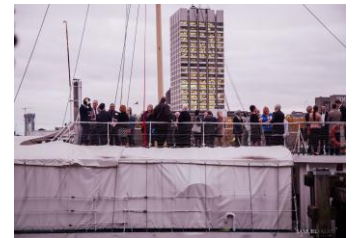
Drink Reception & Networking