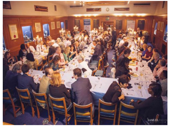
Everyone enjoying their dinner and networking