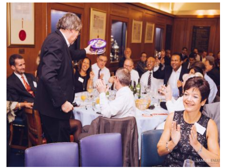
Winners of the Quiz