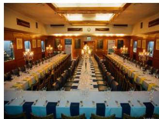
Table setting for Dinner