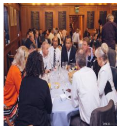
Team in Workshop